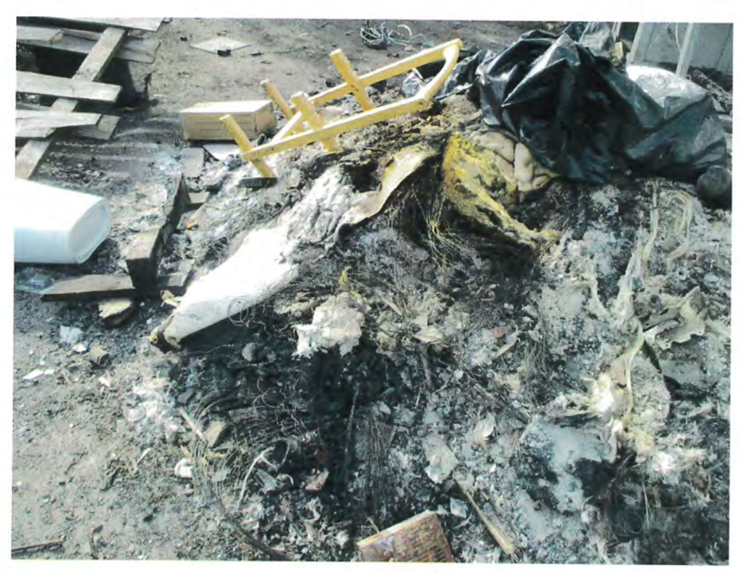
Photo by: L. Grumieaux Exposure #: 3 Comments: Pile of charred debris.

Date: 3/12/2024 Time: 3:39 PM Direction: West Photo by: L. Grumieaux Exposure #: 4